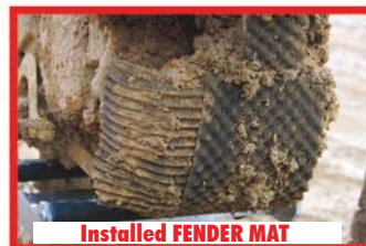
Installed FENDER MAT